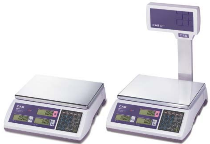
Standard Type ▲