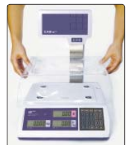
▲ Dust Protection Cover