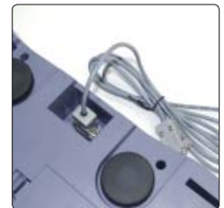
▲ RS-232C Interface