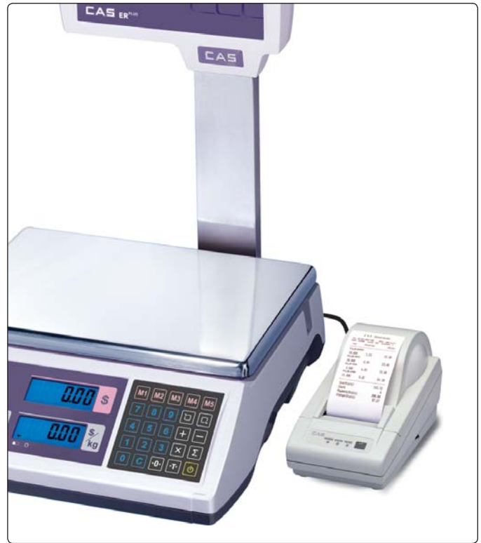
▲ Sample of a Ticket