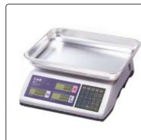
▲ Fish Tray