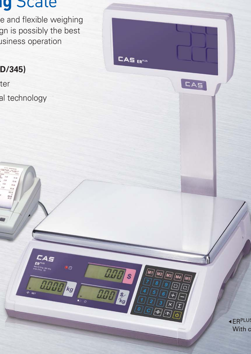
◀ ER PLUS ; With client pole display